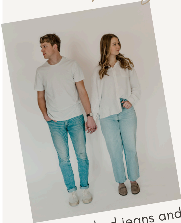
Light washed jeans and white tees!