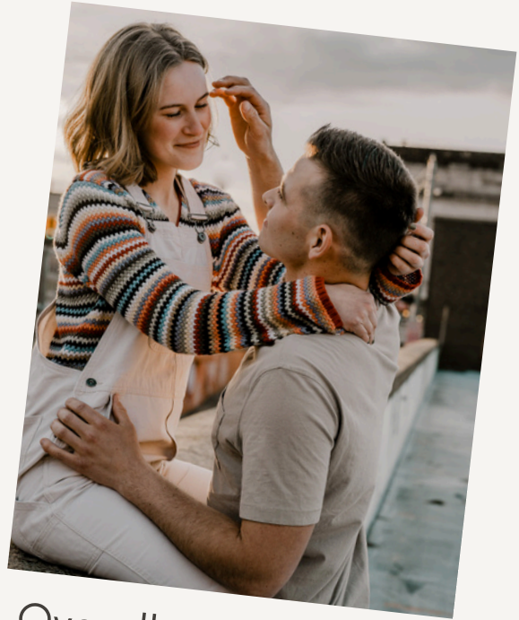
Overalls and stripes! Bold but it WORKS!